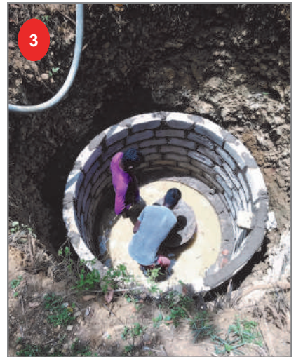
1 Young family standing beside a hole in the ground for a well 2 & 3 A well under construction