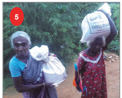
1 An old destitute lady with dry rations delivered to her home 2 The elderly carry their dry rations home 3 In Vavunathivu dry rations are distributed 4 & 5 The elderly on their way home with the dry rations