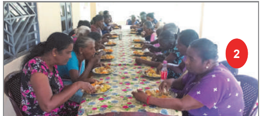
1 Annathanam meals 2 An annathanam